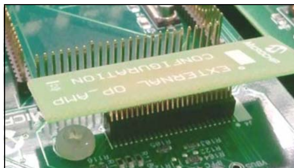
FIGURE 2: EXTERNAL OP AMP CONFIGURATION BOARD