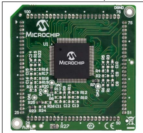
FIGURE 2: EXTERNAL OP AMP CONFIGURATION BOARD